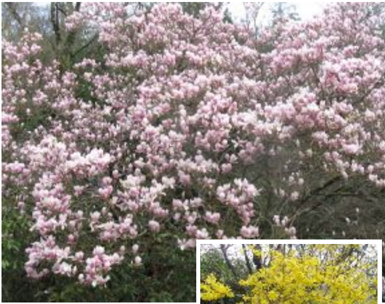
A MAGNIFICENT magnolia, above; the catkins of the silver birch — betula pendula , far right; and forsythia, inset