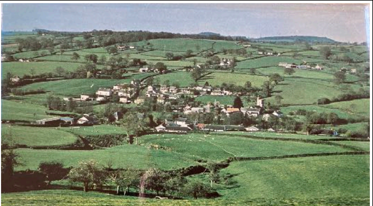
A POSTCARD from the past — date unknown — showing Dalwood village