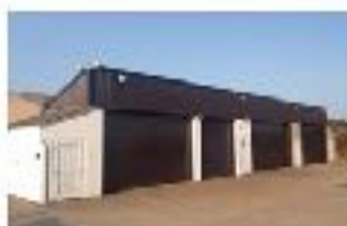
AXMINSTER DEVON EX13 5XD